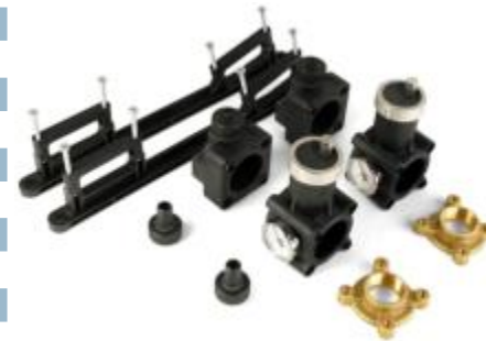
a typical component kit KIT00255003